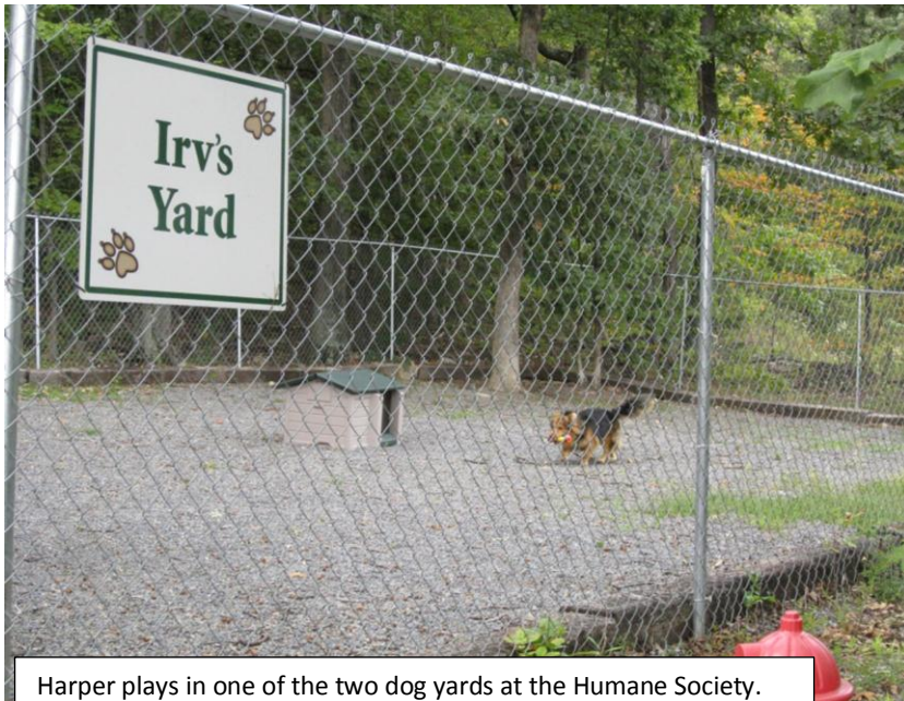
Harper plays in one of the two dog yards at the Humane Society. (He found his forever home recently!)